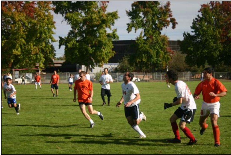
Anglo-Hispanic Soccer Game: